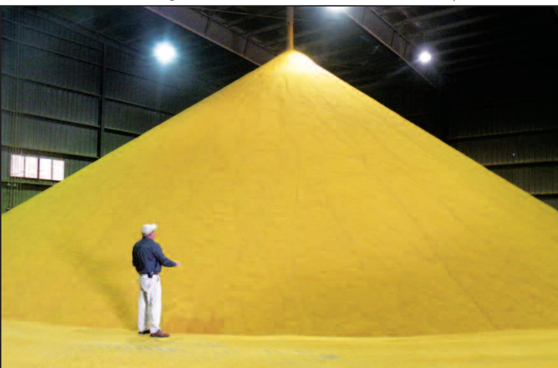
BART FOX , Value Added Ethanol Marketer, watches as the Distillers Dried Grains with Solubles (DDGS) continues to be piled in a warehouse awaiting the next step in the process. DDGS results from the whole kernel corn, which is brought in by local farmers or elevators, being ground into flour and then having much of the starch removed.